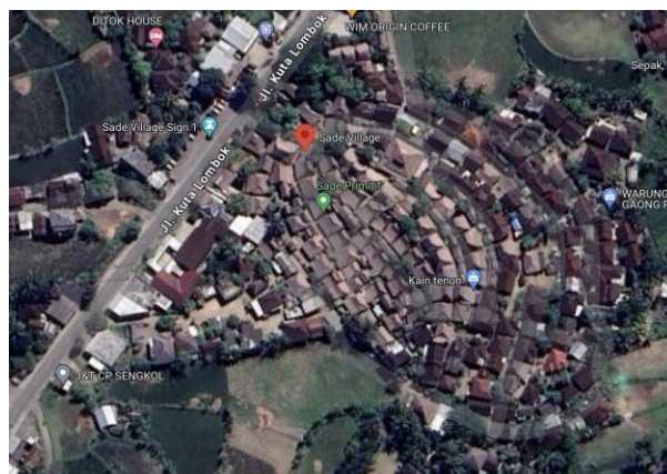
Figure 1. Satellite Image of Sade Hamlet

Sade Tourism Village is one of twenty-one hamlets in Rembitan Village, Pujut District, Central Lombok Regency, West Nusa Tenggara Province which has developed into a cultural tourism village. Rembitan Village is approximately 43 km with a travel time of 50 minutes from the provincial capital, 20 km from the district administrative center and 4.7 km from the center of Pujut District. Administratively Rembitan Village borders Kuta Village to the south, Sukadana Village to the east, Sengkol Village to the north and Prabu Village to the west.